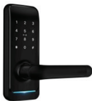
Fig. 03: Interior door handle.